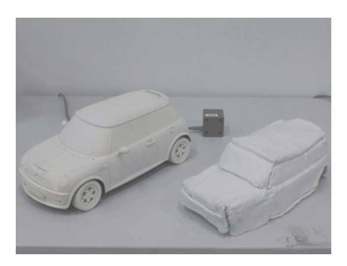
Figure 1: Quimo modelling material mock-up next to a non-deformable material.

Our goal has been to explore how the concept phase of the modeling methodology can be enriched using SAR technologies to allow designers to visualize their concepts with higher detail and provide a more flexible modeling environment.